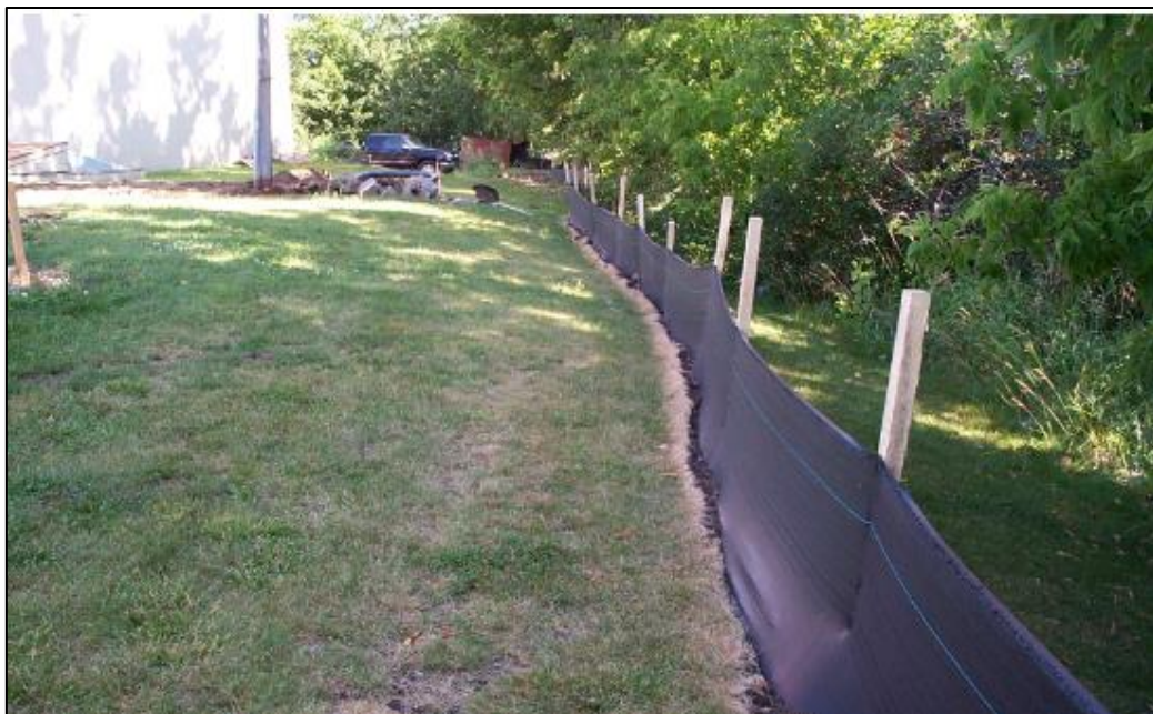
Figure 3.3.1.2.2: Example of silt fence in operation on similar site.

The suitability of the soil conditions will be assessed on site by the Engineer and advice given as to the best course of action in terms of foundation construction.