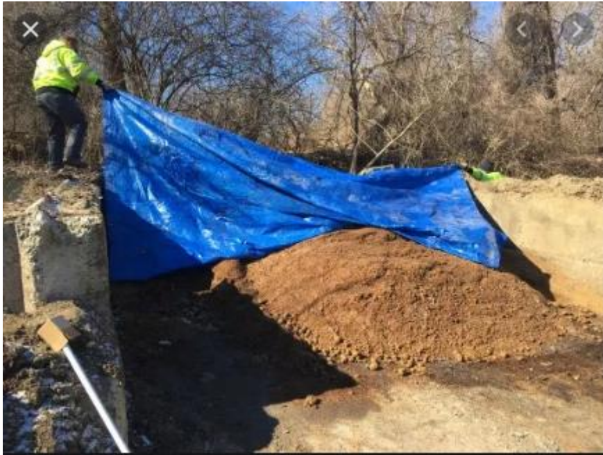
Figure 3.3.1.2.3: Typical impermeable membrane used to dry store topsoil on site.

Topsoil that is stripped back over the footprint of the new house is to be stockpiled in an area to the rear of the site (see Site Layout Plan), which is approximately 36m from the existing stream, will be covered with an impermeable membrane for later use on garden areas. This to reduce saturation of soil and subsequent silting. This is shown in Figure 3.3.1.2.3 .