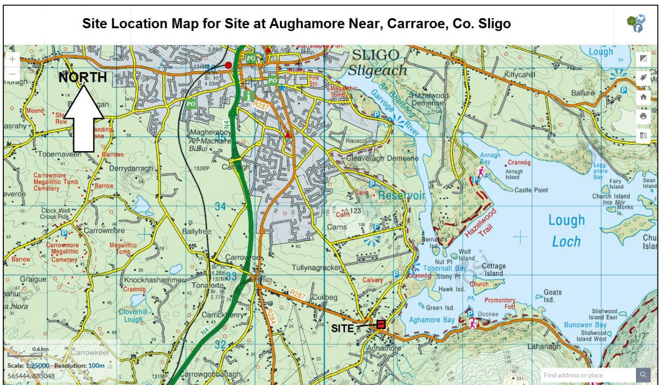
Figure 2.2.1: 1:25,000 Scale Site Location Map

A small stream flows through the front of the site in a north-easterly direction and all proposed works are situated away from this stream. An existing small bridge allows access over the stream to the dwelling. To the north-east of the site is an adjacent dwelling; to the north-west and south-west is agricultural land; and the south-eastern boundary is formed by a local road which joins the R287 a short distance to the south-west of the site. To the east ca. 250 metres away is Lough Gill.