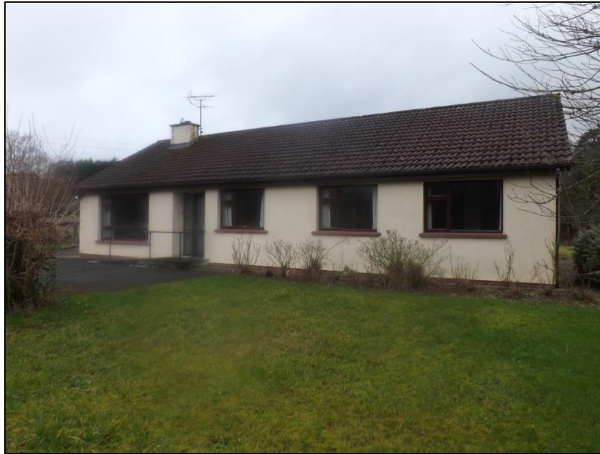
Photo of Front Elevation