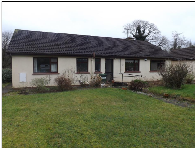
Photo of Rear Elevation