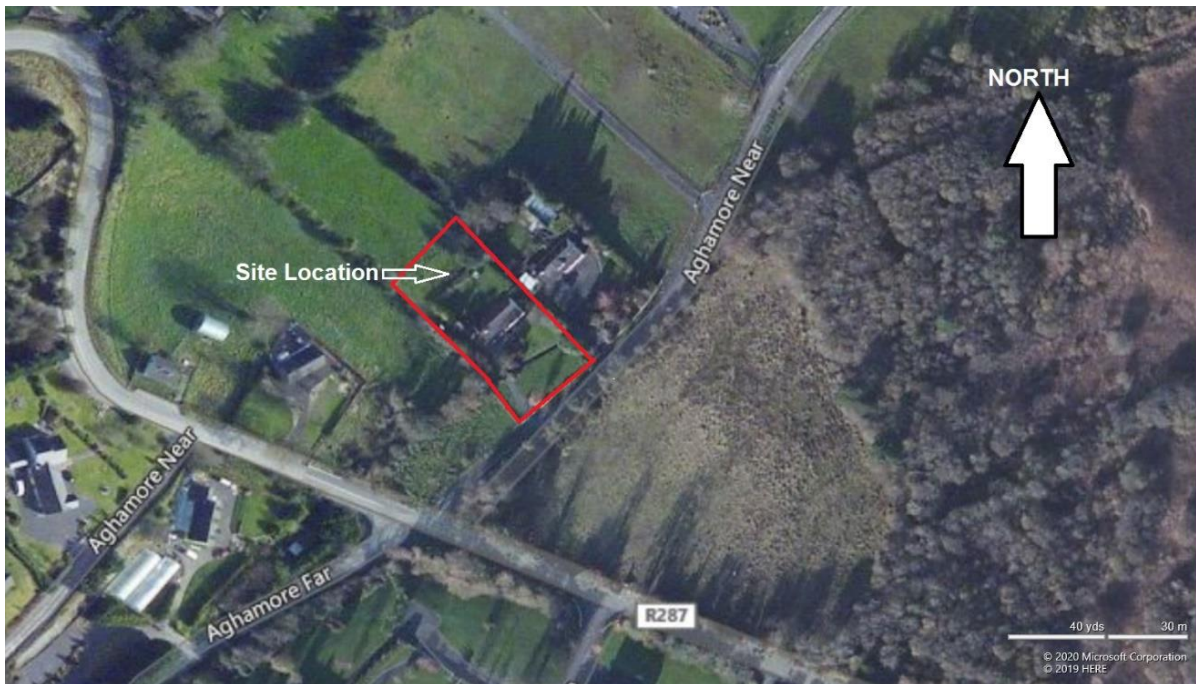
Figure 2.2.: Aerial Photo of Existing Site at Aughamore Near (Source: Bing Maps).

In 2020, a separate planning application was lodged by Antoinette Burns and was approved by Sligo County Council for this site for a proposed single storey extension and alterations to an existing dwelling and all associated site works at Aughamore Near, Carraroe, County Sligo. This was granted Planning permission under PL20/119.